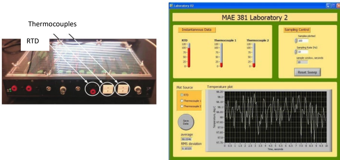
Fig. 2 (Left) National Instruments M-Series carrier showing connections for 3-prong RTD and thermocouples, and (Right) Screenshot of VI for recording temperature vs. time data.

There were many positive aspects of the activity. From working with the desktop DMM, students were able to see how both devices worked on a fundamental level. The provided VI allowed for plug and play operation so students could focus on taking measurements. However, the VI was still somewhat of a ‘black box’ to students. There remained a significant gap in understanding the process in going from the basic electrical measurement to the virtual instrument. For example: how is the third wire of the RTD used in the VI? or how does the VI compute a reference temperature without a cold bath?