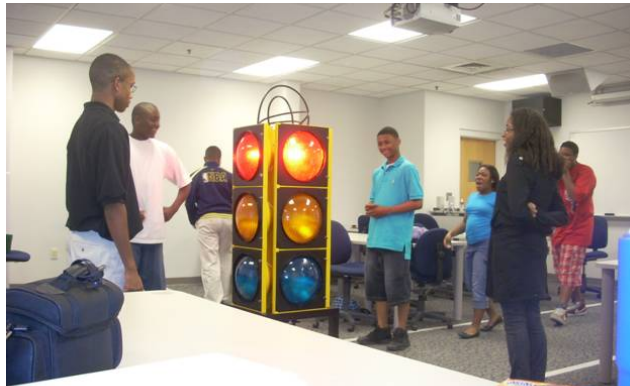
Figure 1: Intersection Mumble Jumble

Instructors then focused on constructing a signalized intersection while ensuring that each portion of the timing plan was introduced as a solution to a particular issue that was observed in the intersection mumble jumble .