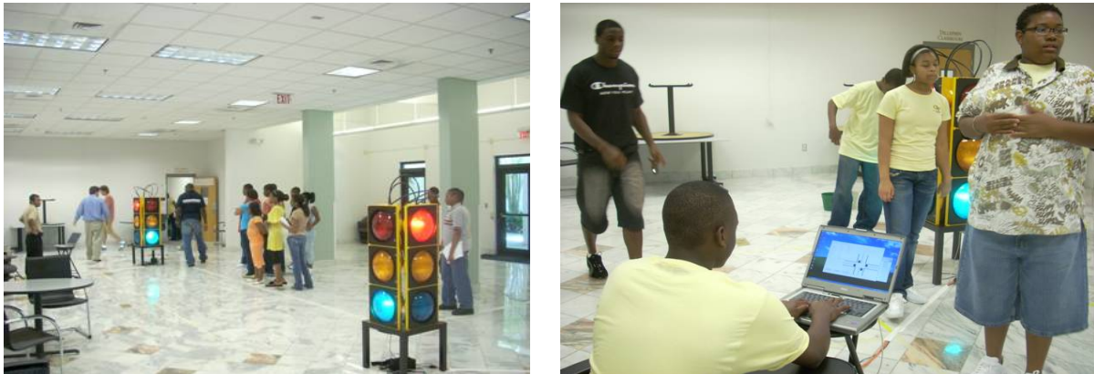
Figure 4: The Design Challenge

The week-long camp culminated in a design challenge. The objective of the traffic challenge was to minimize total delay (one of the key measures of effectiveness used in design) through a corridor of two intersections by collecting the most poker chips. Each team was given different corridor characteristics, thereby requiring each team to design their own unique signal timing plans. Figure 4 illustrates the students executing their design challenges. This section outlines the main components of the design challenge. Note that the design challenge required students to integrate many of the traffic engineering concepts they learned throughout the week (that are not detailed in depth in this paper due to space constraints).