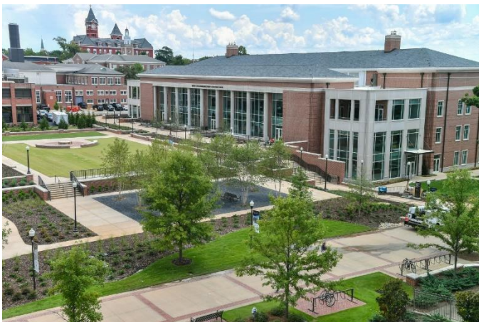
Auburn University's Brown-Kopel Engineering Student Achievement Center recently completed in 2019 and 2020 Conference venue.

Please regularly visit the meeting information website at www.eng.auburn.edu/sites/asee and www.asee-se.org our section website for the call for papers, abstract submissions, workshop proposals and (Continued on page 2)