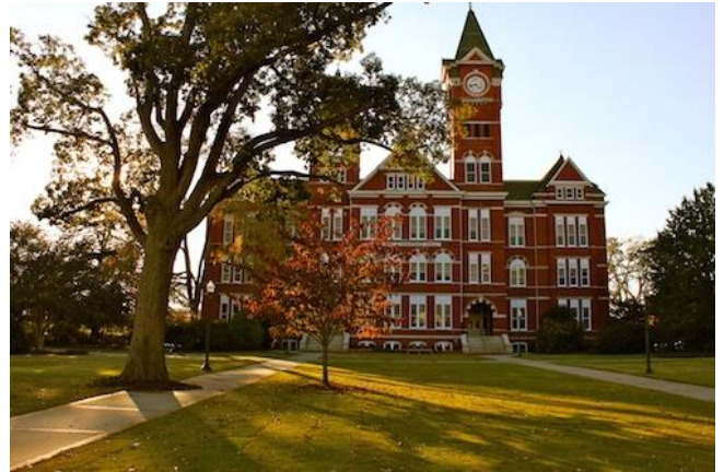
William J Samford Hall, administration building with its clock tower on the beautiful campus of Auburn University

The college has 19 online offerings that provide on-campus equivalent experiences; the online education program is ranked 12th in the nation. Prominent alumni of the College include 4 astronauts and Tim Cook, CEO of Apple, Inc.