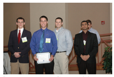
Student Poster Competition Award Recipients

The large student attendance supported an outstanding Student Poster Competition. Award recipients are included