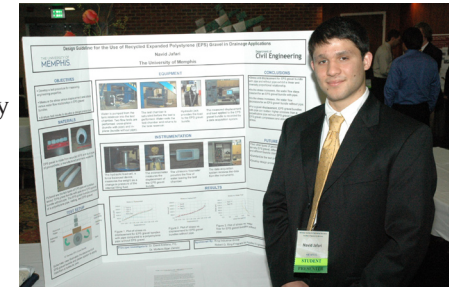
Award-winning student presentation