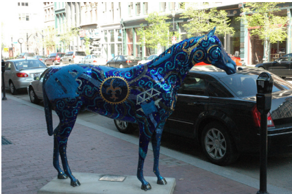
Sights of Louisville