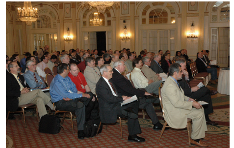
Opening session in the historic Brown Hotel's Crystal Ballroom