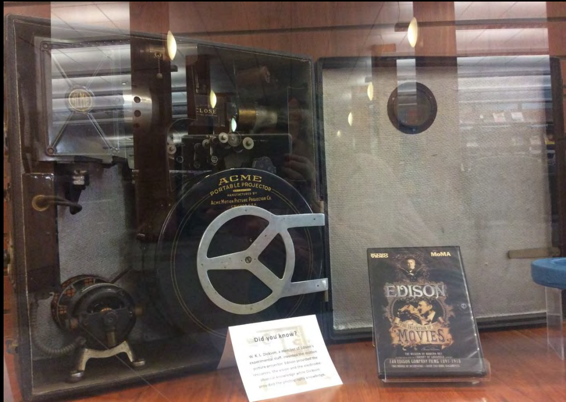
From College of Engineering