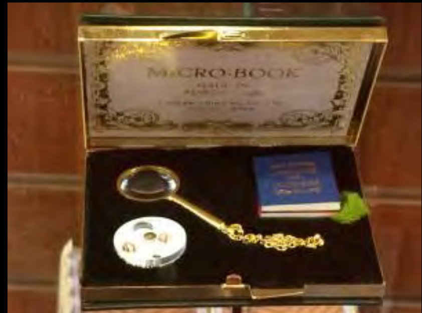
From Special Collections