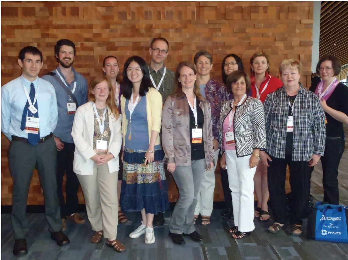
ELD student attendees and sponsors.

It seems we have the start to a successful program that the members of ELD are interested in seeing continue and grow.