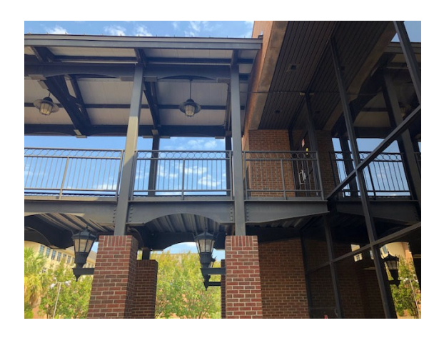
Figure 1: Exterior walkway between two campus buildings

The students were provided the external loads on the structure. Working in groups, they had to measure the length of structural elements and use the information to determine the load path of this existing structure. The students had to determine how much load and what type of load is carried by each of the floor members, and use that information to draw free body diagrams of each member.