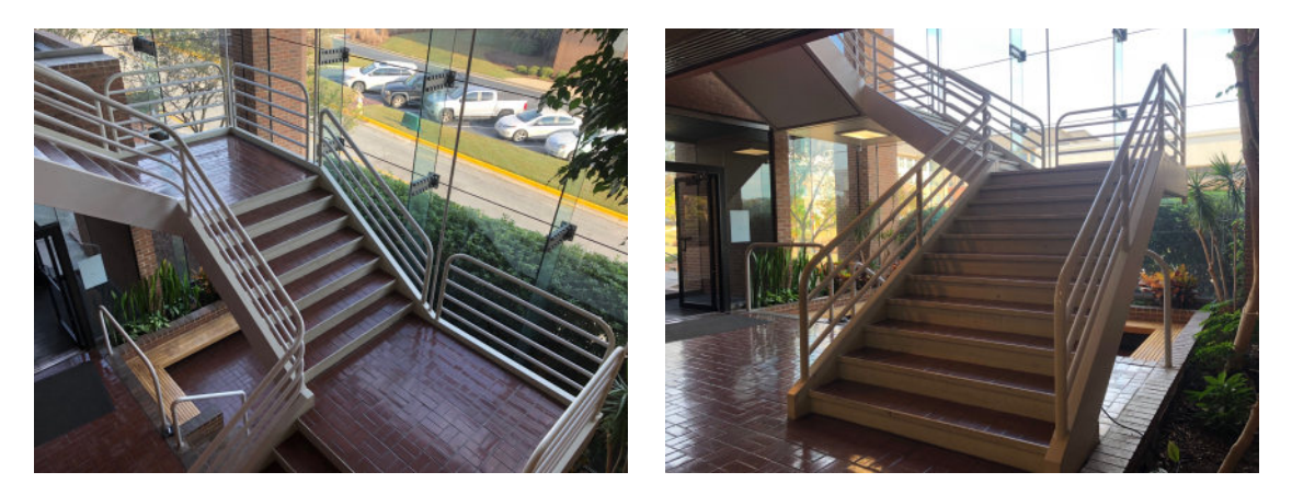
Figure 5: Image of Suspended Lobby Stair

For the second computer modeling lab, students were asked to produce a 3D computer model of the suspended switchback lobby stair in the main engineering building on campus. The lobby stair shown in Figure 5 below, was chosen due to its geometric complexity and threedimensional aspect. Working in groups, students measured the sizes and dimensions of all the major structural elements, and determined the loading on these structural elements. Based on the sizes and measurements obtained from the site visit, the students modeled the stair in 3D and were asked to determine the safest location to place a 500-lb Mercer Bear statue on the stair.