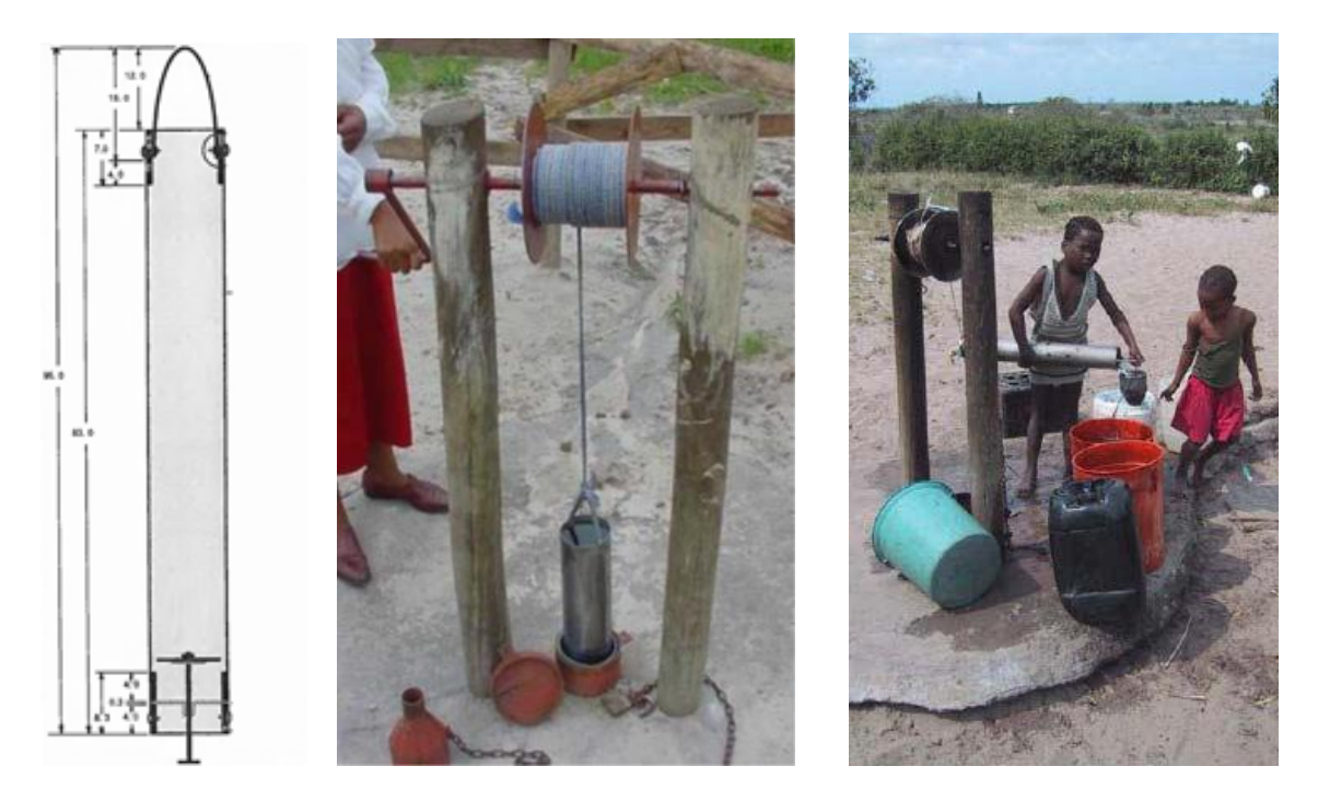
Figure 1 (a) an engineered diagram of a bailer, with a one-way valve at bottom, <sup>5</sup> (b) a bailer being lowered into a borehole in northern KwaZulu-Natal, South Africa,<sup>6</sup> and (c) water from a bailer being emptied into a jerrycan<sup>6</sup>

weight of the water to close the one-way valve. The bailer used for this class activity consists of a 75-mm diameter PVC pipe (secured at the top end with a rope) which has a ball valve at the lower end. In addition to being used for pump testing, water sampling, and well development, bailers (sometimes referred to as 'bucket pumps'<sup>4</sup>) are also used in some developing community settings to collect drinking or irrigation water from boreholes (Figure 1b, 1c).