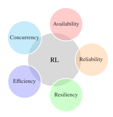
Figure 1: Components of a successful RL

harnessing previously developed strategies. Each platform has different goals for education and thus fits into a different niche.