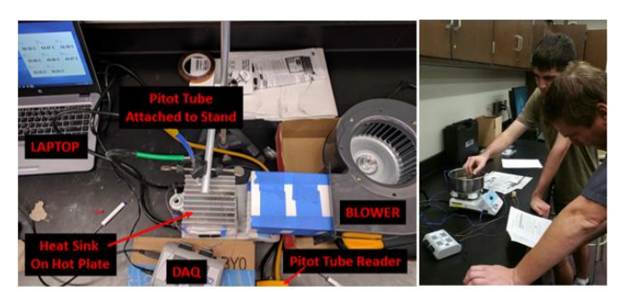
Figure 2. a) Lab 5 experimental configuration and b) students conducting Lab 4.

students were assigned to design and conduct an experiment that implemented lumped system analysis in weeks 7-8. Prior to labs, students brainstormed with their group members to select and prepare a specimen that met the criteria for a lumped system, and created experimental plan. Then they brought the specimen, e.g. a potato, to the lab, placed it in a heating or cooling process created in the lab, and recorded actual temperature variation using a data