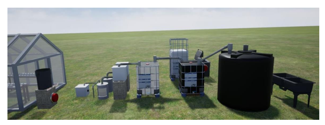
Figure 3: 3D VR-WEF system developed in Unreal Engine