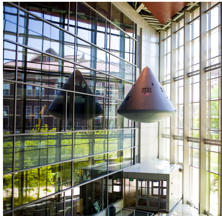
A replica of the Apollo 1 capsule hangs in the atrium in the Neil Armstrong Hall of Engineering, one of the conference venues.

Call for Abstracts— http://ENGINEERING.PURDUE.EDU/ASEE2018ILIN