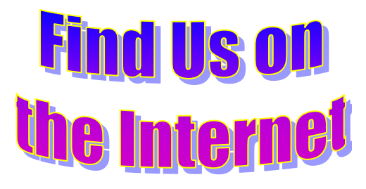
Checkout our website! <u>https://gsw.asee.org/</u>. including

links to previous and future conferences, newsletters, and information about our Section.