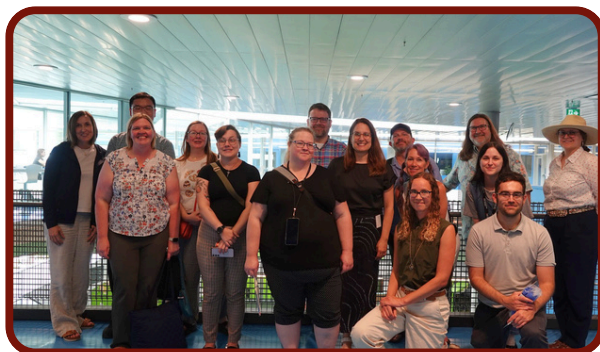
Right: ELD Members visit the Louise-Lalonde-Lamerre Library at Polytechnique Montréal.