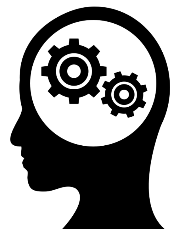
Created by Creative Stall from Noun Project

Who do you know who matches any one of these criteria?