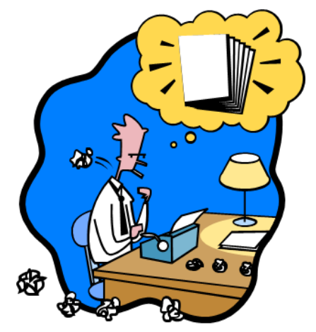
Try the FRIENDLY PAPER REVIEW SERVICE

Your paper will be informally reviewed by two people, and each will provide you with comments and suggestions for improving your paper.