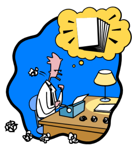
Try the FRIENDLY PAPER REVIEW SERVICE

Want to improve your chances of having your manuscript accepted for publication?