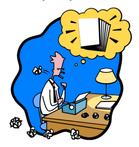
Try the FRIENDLY PAPER REVIEW SERVICE

Want to improve your chances of having your manuscript accepted for publication?