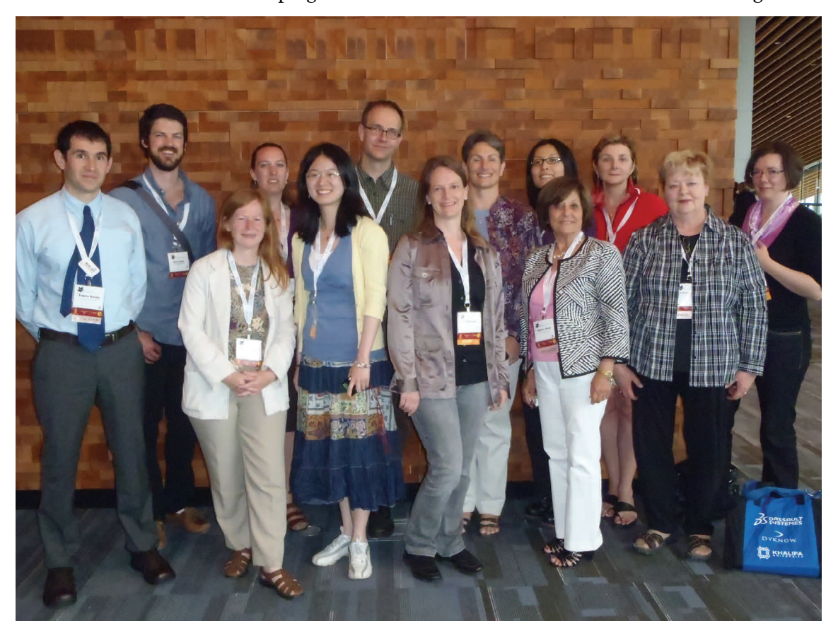
ELD student attendees and sponsors.

It seems we have the start to a successful program that the members of ELD are interested in seeing continue and grow.