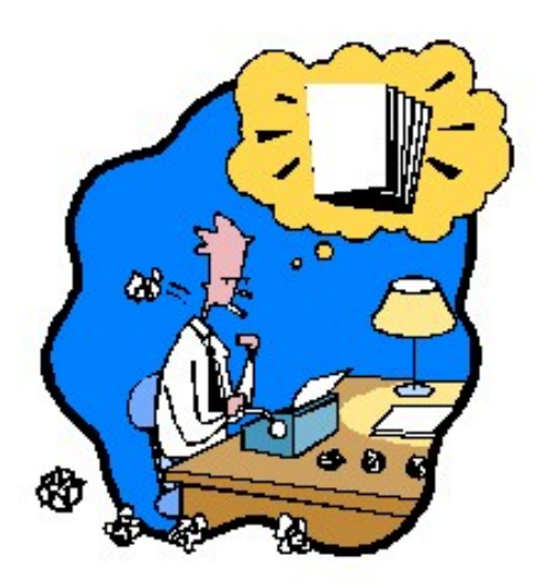
Try the FRIENDLY PAPER REVIEW SERVICE

Want to improve your chances of having your manuscript accepted for publication?