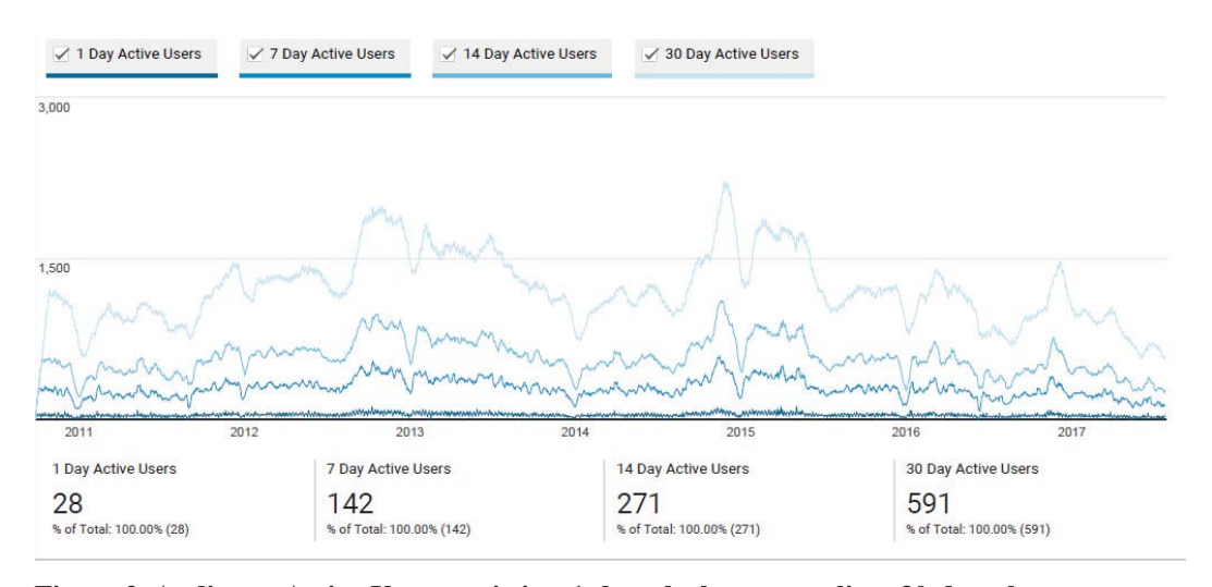
Figure 2. Audience, Active Users statistics: 1-day, the lowermost line; 30-day, the uppermost.